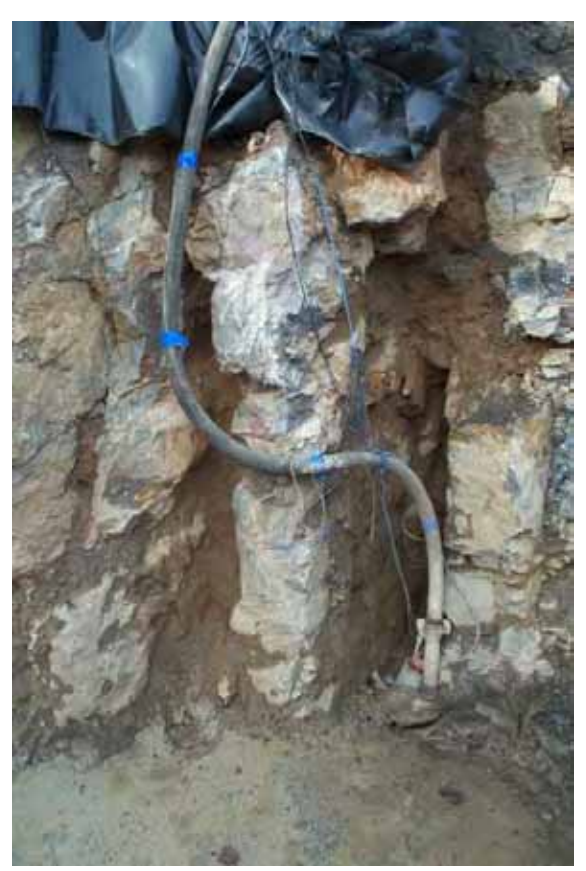
Plate 2: Close-up of fissures