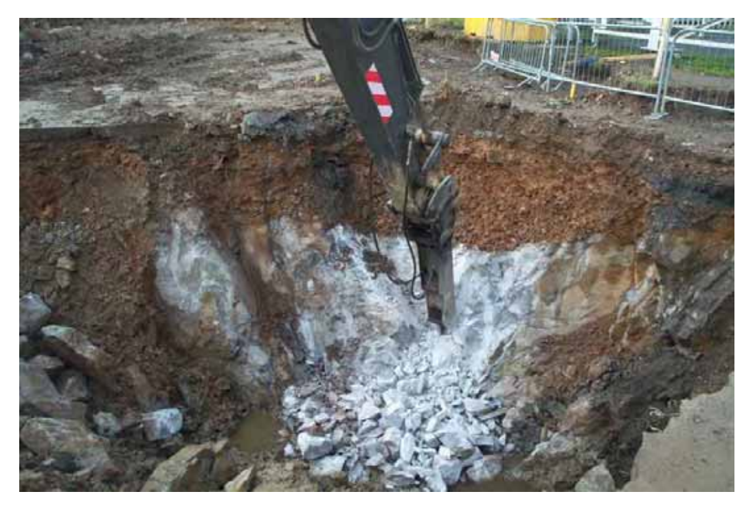
Plate 1: Groundworks for Receiving Hopper from the east