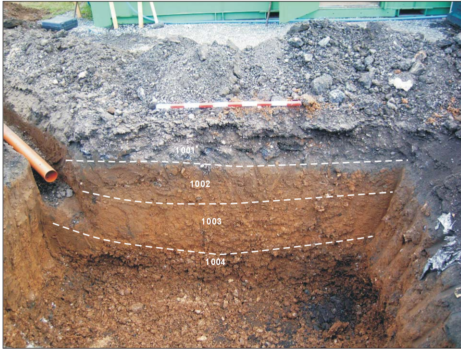
Plate 1: South-west facing section, Test pit 1