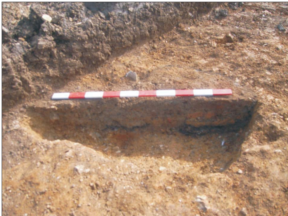
Plate 2: Trench 2 - Oven 213 after excavation

This material is for client report only © Wessex Archaeology. No unauthorised reproduction.