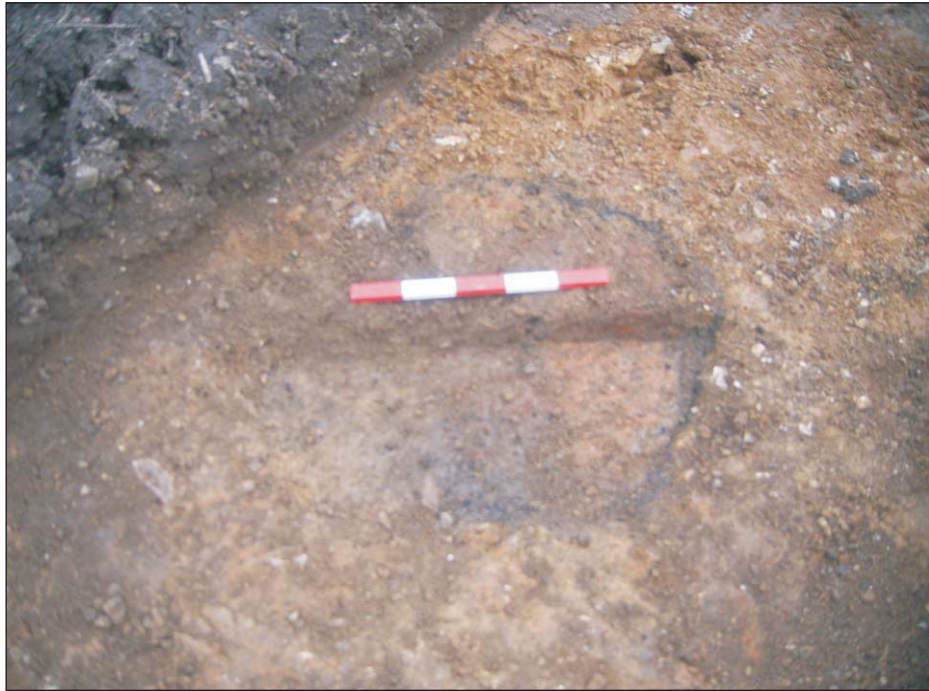
Plate 1: Trench 2 - Oven 213 before excavation